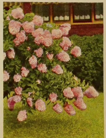
Famous Old Hydrangea P. G.

SPRING GLORY FORSYTHIA. Loveliest of all Goldenbells. Dwarf. Large, creamy yellow flowers in profusion. 18-24 in., $1.00 each. 2-3 ft., $1.50 each. 3-4 ft., $2.00 each.